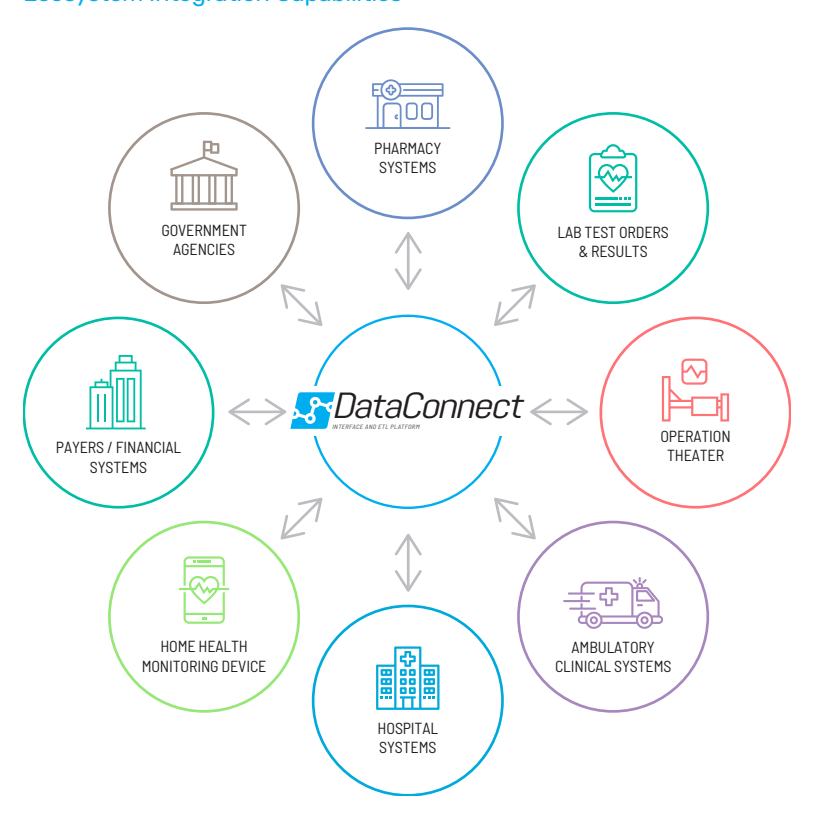
Figure 1: DataConnect allows you to seamlessly configure, test and deploy interfaces across multiple touch-points